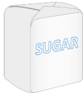
Bag Of Sugar 90p

Here are the prices of some items at the supermarket: