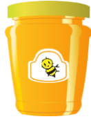
Jar Of Honey £1.40